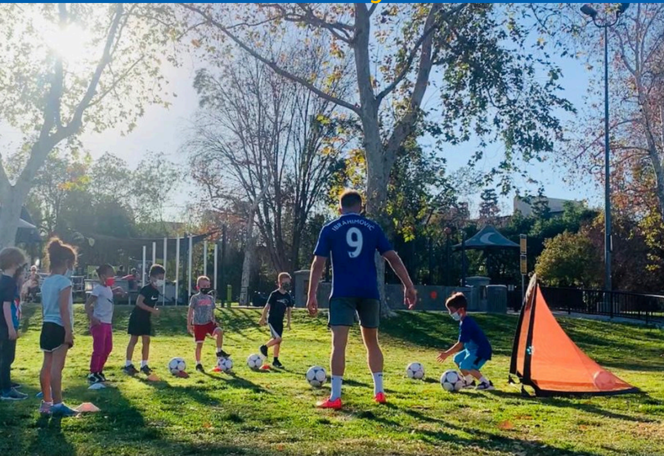
First class held August 2020