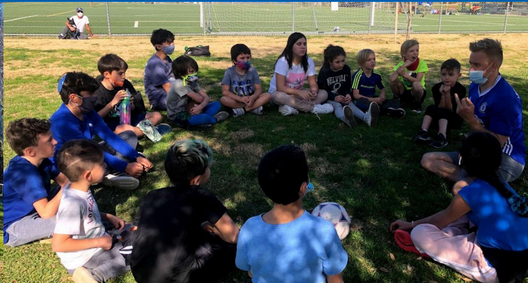
NAA became established Dec 2020